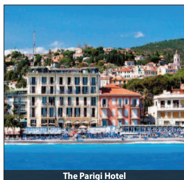
The Parigi Hotel