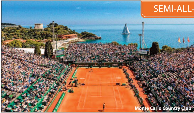
Monte Carlo Country Club