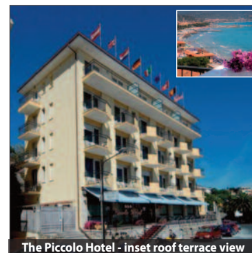
The Piccolo Hotel - inset roof terrace view