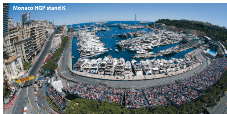
Monaco HGP stand K