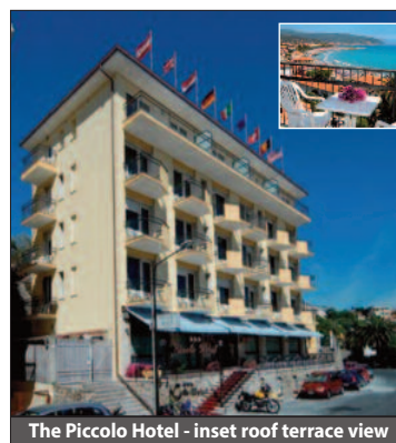
The Piccolo Hotel - inset roof terrace view

Set in a quiet location within walking distance of the sea and centre of Diano Marina, the hotel has a panoramic terrace and restaurant and a comfortable bar. All bedrooms have en-suite facilities, telephone, and satellite TV. The restaurant offers breakfast and dinner. There's free drinks between 6pm and 11pm each night including local brands of beer, wine and spirits.