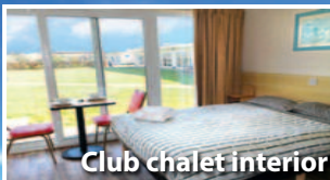
Club chalet interior