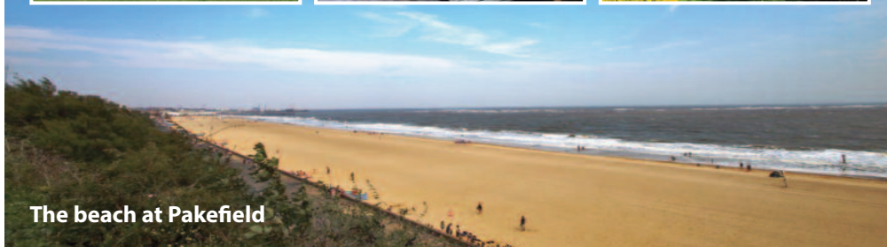
The beach at Pakefield