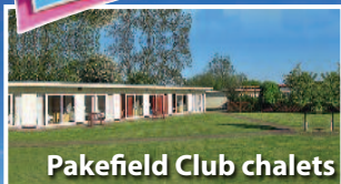
Pakefield Club chalets