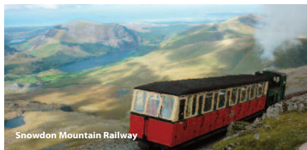
Snowdon Mountain Railway