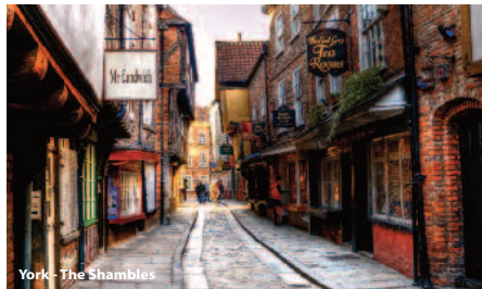
York - The Shambles