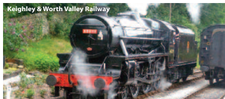
Keighley & Worth Valley Railway